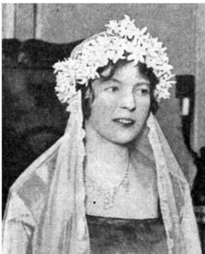
Nancy Cunard 1916 E.V.

In the book she also mentioned Crowley's Céfalu years in two letters to her friend the British essayist and novelist (George) Norman Douglas (1868-1952), an old friend of Crowley: