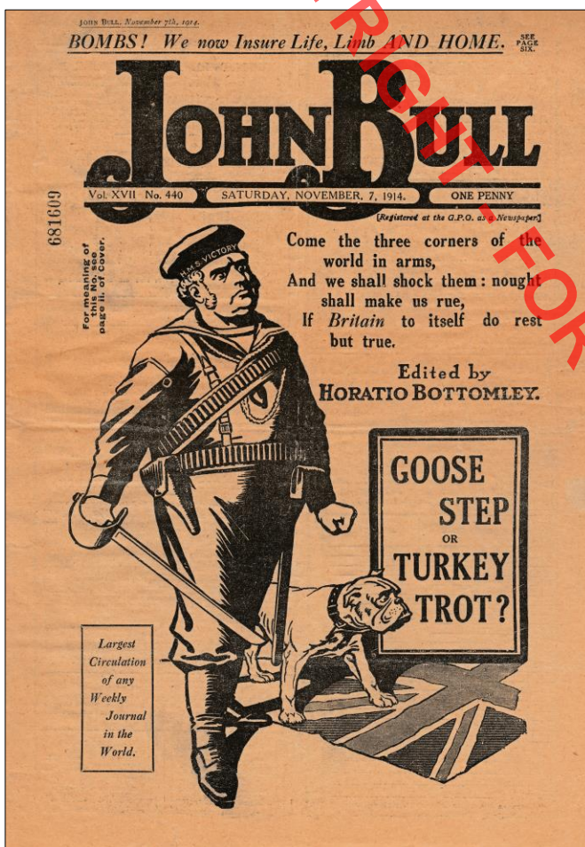
Cover of John Bull from WW1 (Saturday, November 7, 1914 E.V.)

I have always been fond of animals – especially those of what is ironically called the dumb creation. I am a bit like that German philosopher who, when his dog offended him, exclaimed "Get out of the room – you dirty man." 2422