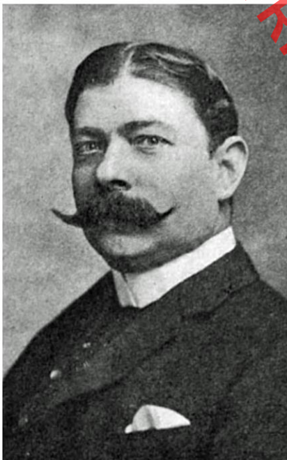
Frank Harris c. 1901

Crowley was not forgotten, neither Frank Harris, and an article published in John Bull , January 10, 1920 E.V., headed: "Another Traitor Trowned. Career and Condemnation of Notorious Aleister Crowley", dealing with the years in America during the war and the propaganda writings, still in fresh memory: