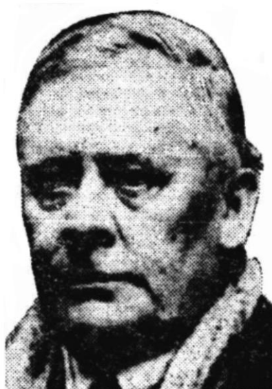
Horatio Bottomley 1922 E.V.

[...] Bottomley's long lease was about to expire. The constable he had outrun was on his heels. The blackmailer, attempting to resist being blackmailed, was beginning to see one of the magical virtues of silence. I couldn't publish an attack on a man in the witness-box which was evidently temporary accommodation on the way to the dock. So I held my peace and wrote to Bottomley to tell him that I bore no malice and hoped he would clear himself. I hope it comforted him in penal servitude to remember that one, at least, of the men whom he had wantonly wronged wished him well. 2426