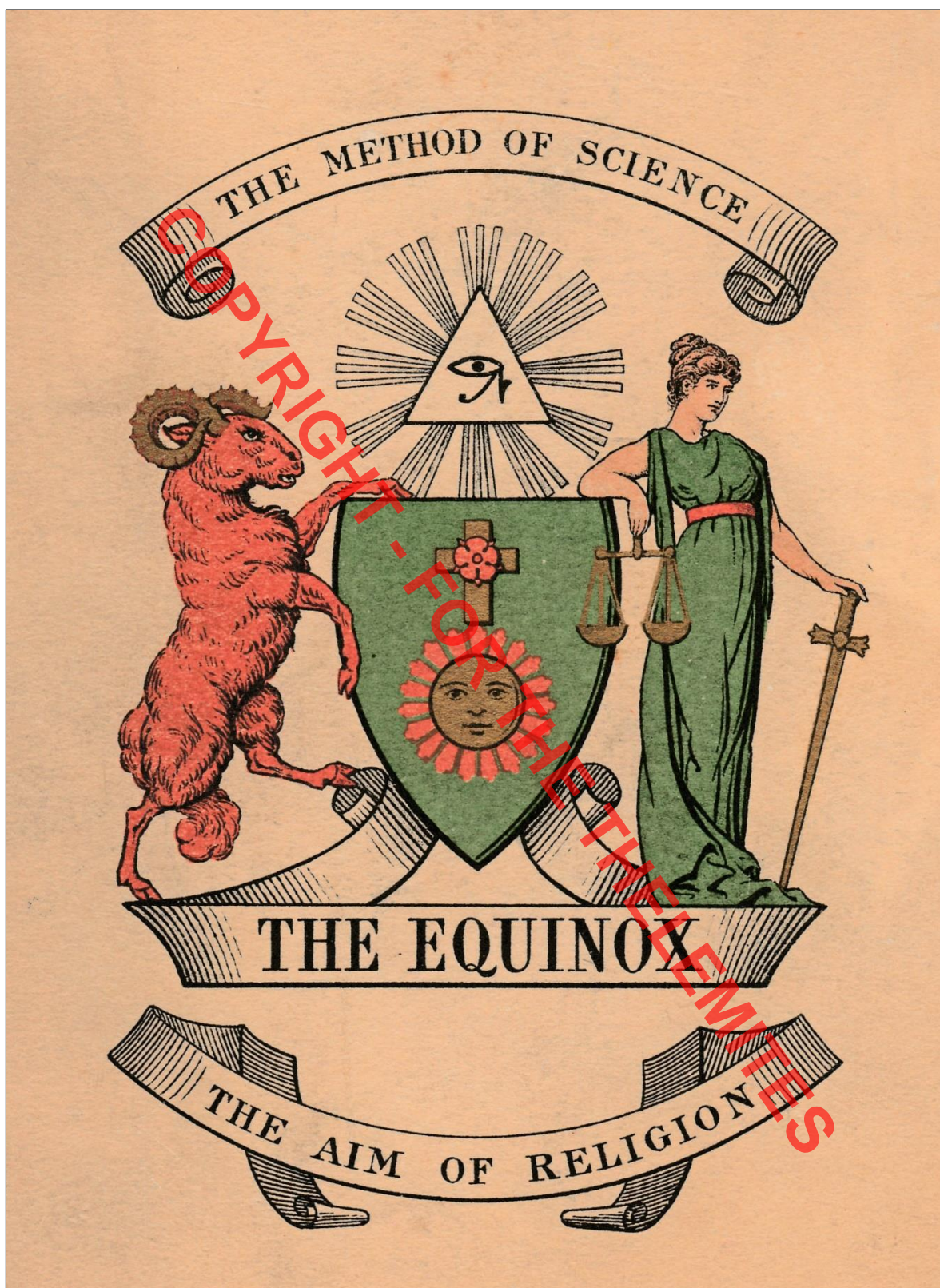
The Motto: " The Method of Science – The Aim of Religion ", on the upper cover of Aleister Crowley's bi-annual review The Equinox .