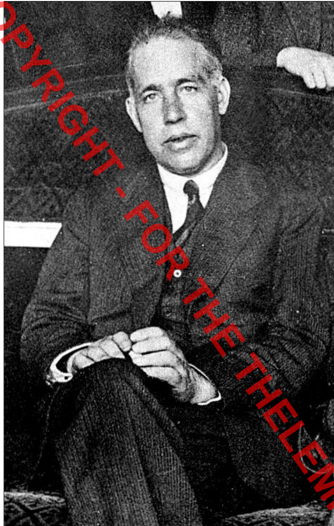
Niels Henrik David Bohr (1885-1967). Danish physicist. Winner of the Nobel Prize in Physics 1922 E.V. – Photographed 1935 E.V.