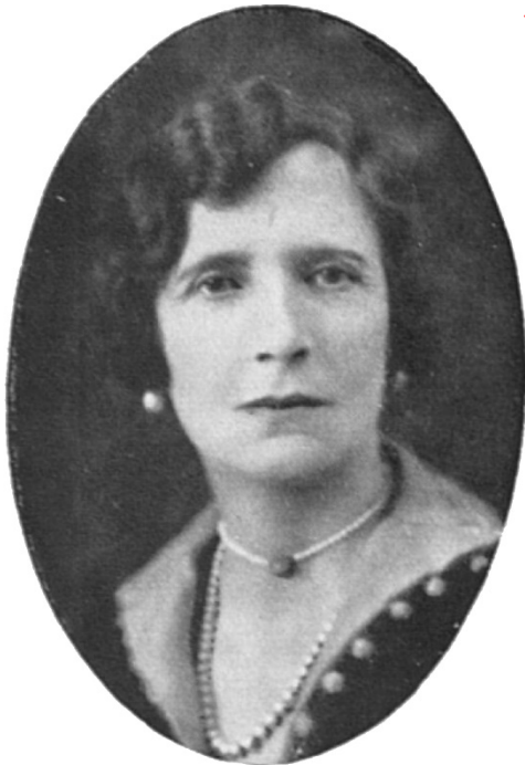
Nesta H.(elen) Webster (née Bevan)(1876-1960)

One who likely had attended the lecture was Colonel J. F. C. Fuller since he was recorded on the list of commentators at the next meeting's lecture, which was titled " The Influence of Tanks Upon Tactics " and given on December 7, 1921 E.V. 28